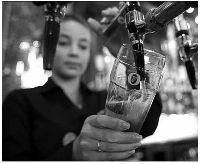
POVERTY PAY: pub chain JD Wetherspoon uses zero hours contracts

Although the zero-hours contract has no legal definition, European legislation broadly divides workers into three categories with different rights and responsibili-