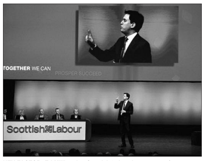
HEX FACTOR: Ed Miliband at Scottish Labour's recent conference

They added that Labour had called for the cap first and that the Coalition Government was merely implementing Labour policy. Of course, not a whisper of this Labour policy had been heard during the three-day, conference in Perth.