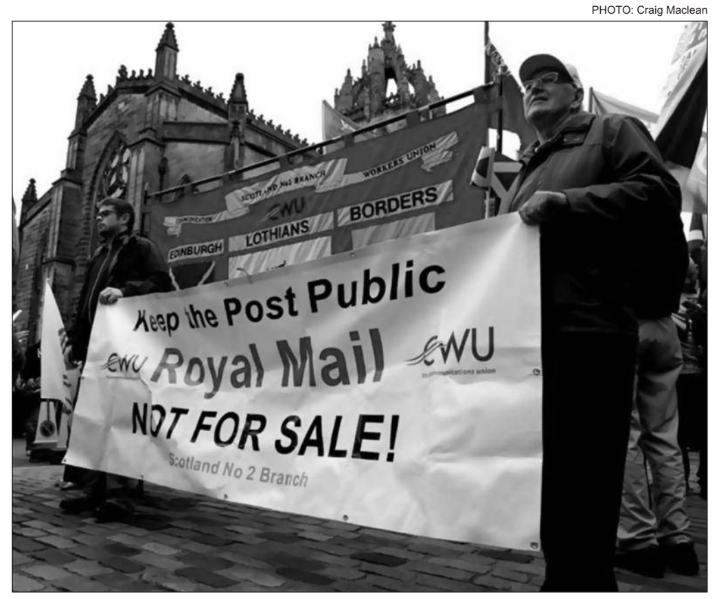
CWU: UK conference decision to call for a No vote flies in the face of the sentiment of Scottish meetings

It is no accident that the leaderships of giant unions like UNITE and UNISON - plus the STUC as a whole - have remained studiously unaffiliated to either the Yes or No campaigns, whilst in fact regularly lacerating Better Together for its lack of vision and failure to persuade workers of any bene-