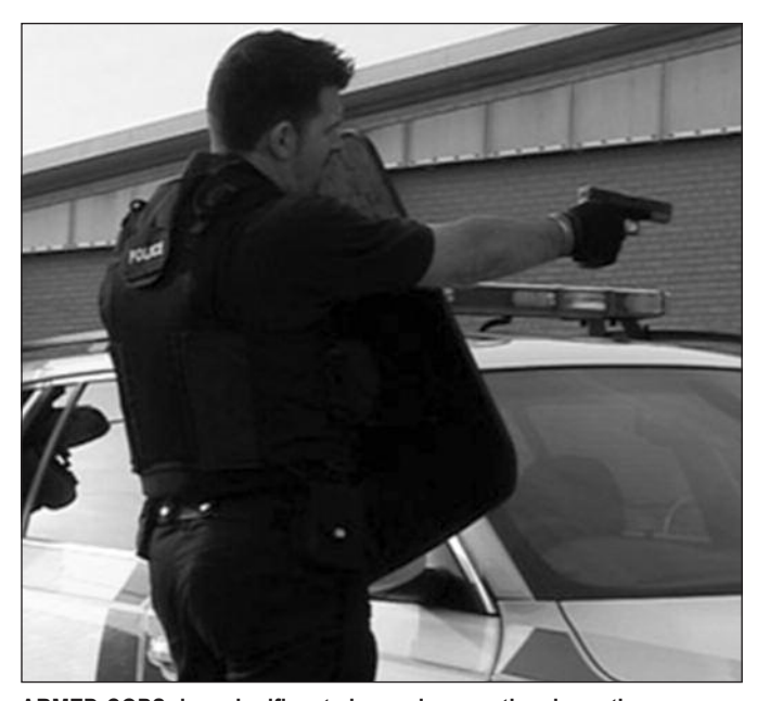
ARMED COPS: in a significant change in operational practice, Highlands armed response officers supporting normal, everyday policing could routinely be on the streets and armed

side-arms clearly visible. Assistant Chief Constable Higgins, in an exceptionally swift letter responding to press coverage, was very direct, '...with the creation of Police Scotland the decision was taken to provide a standing authority for a limited number of trained ARV officers to overtly deploy with sidearms and less lethal weapons.' There you have it. That's how we moved from an unarmed to an armed presence on the street.