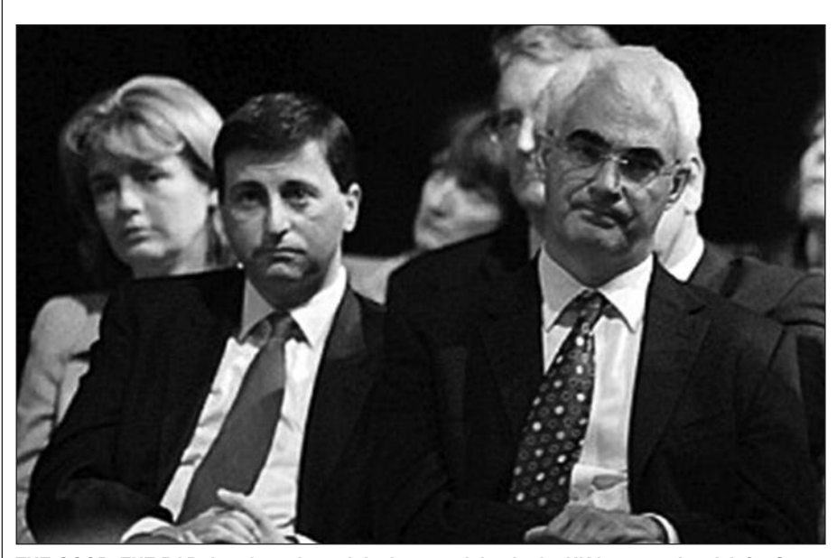
THE GOOD, THE BAD: but the ugly truth is that remaining in the UK is a massive risk for Scots

Better Together while they and their Lib Dem soulmates continue to assault the poor.